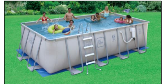
3. FILL WITH WATER