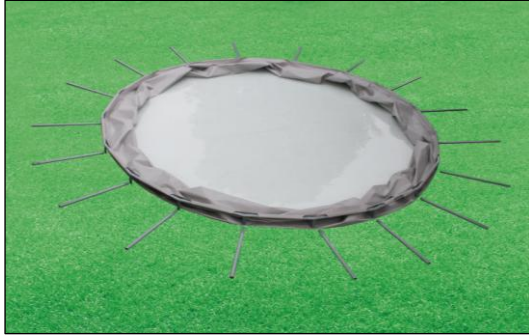
1. SELECT LEVEL LOCATION