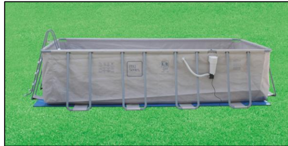
2. ASSEMBLE HORIZONTAL & VERTICAL BEAMS