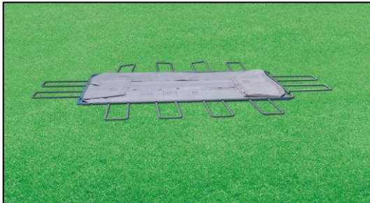
1. SELECT LEVEL LOCATION