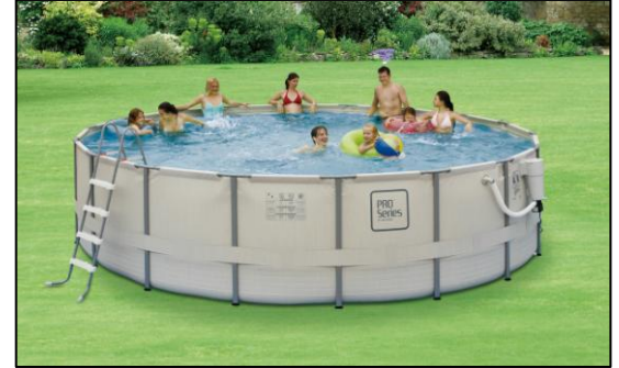
3. FILL WITH WATER