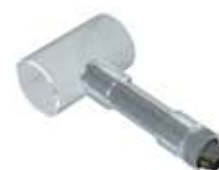
TechNode In-Line for Heaters/Plumbing