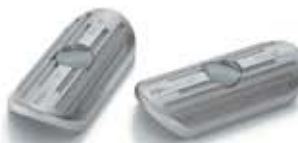
TechNode For Pool Ladders Sold in Pairs