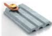
TechNode For Pool Lights