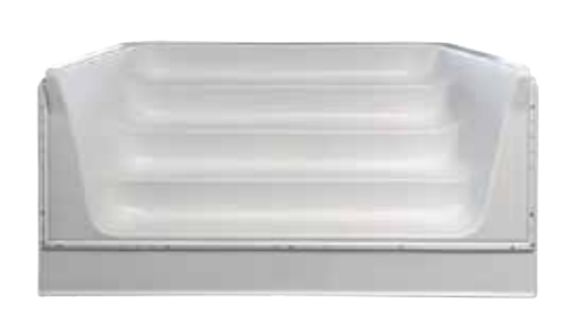
CS-0084S 8 ft. 4-tread Straight