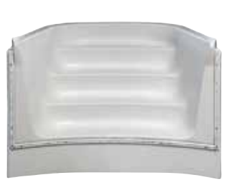
CS-0064R 6 ft. 4-tread Radius