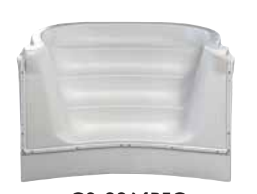
CS-0064RFC 6 ft. 4-tread French Curve Radius