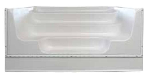
CS-0084TSC 8 ft. 4-tread Twin Seat/Step Straight Cantilever