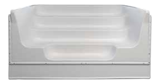
CS-0084TS 8 ft. 4-tread Twin Seat/Step Straight