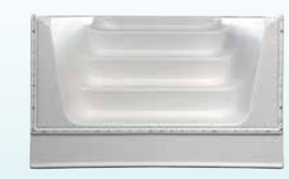
CS-0064SC 6 ft. 4-tread Straight Cantilever