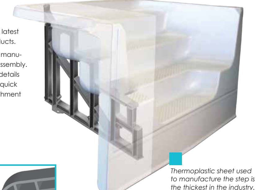
Concrete tube attachment with a quick twist insert, tube forms are securely placed for additional support for concrete decking.

The Cardinal Step is designed for durability, manufactured with precision, and built for easy assembly. Taking it a step further, we kept our eye on details such as using the thickest sheet material, a quick "click" fastening assembly, a molded attachment for concrete tube forms, and more.