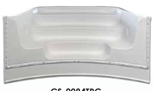
CS-0084TRC 8 ft. 4-tread Twin Seat/Step Radius Cantilever