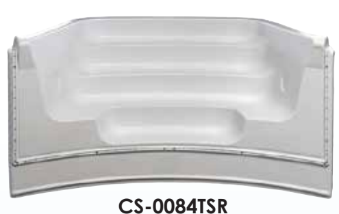
8 ft. 4-tread Twin Seat/Step Radius